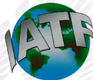
CERTIQUALITY S.r.l. - IL PRESIDENTE Via G. Giardino 4 - 20123 MILANO (MI) - ITALY